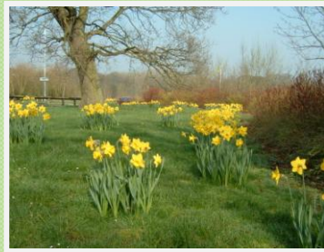
Daffodils planted at Westmorland Park