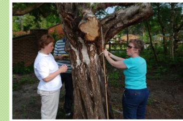
Tree surveying for Ancient Tree Hunt